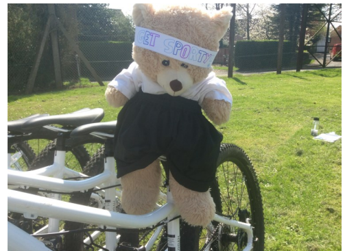
Rockstar Bear having fun cycling