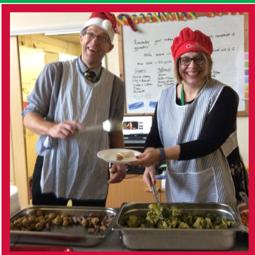
First day back Monday 6th January

Let's continue to improve as we're aiming for 100% attendance!