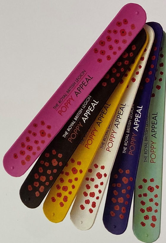
Snap band - Suggested Donation: £1.50