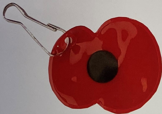
Reflector - Suggested Donation: 50p