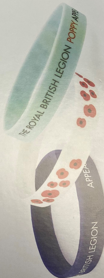
Silicon wristband - Suggested Donation: £1.00