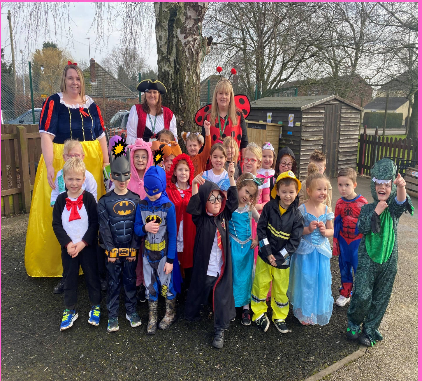
This morning we had a whole school World Book Day assembly where we shared the amazing costumes that the children and staff dressed up in. We also talked about our favourite books and characters.