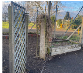
The Quiet Area