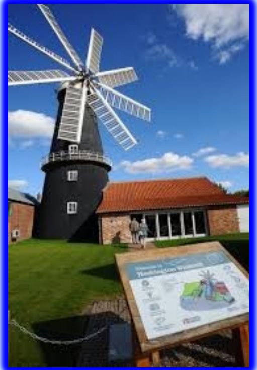
Maple class using a map to find significant features of the village and navigating to the Windmill.