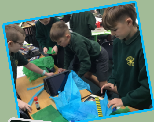
Rowan class have been making 3D models of rivers to inspire their river poetry work in English.